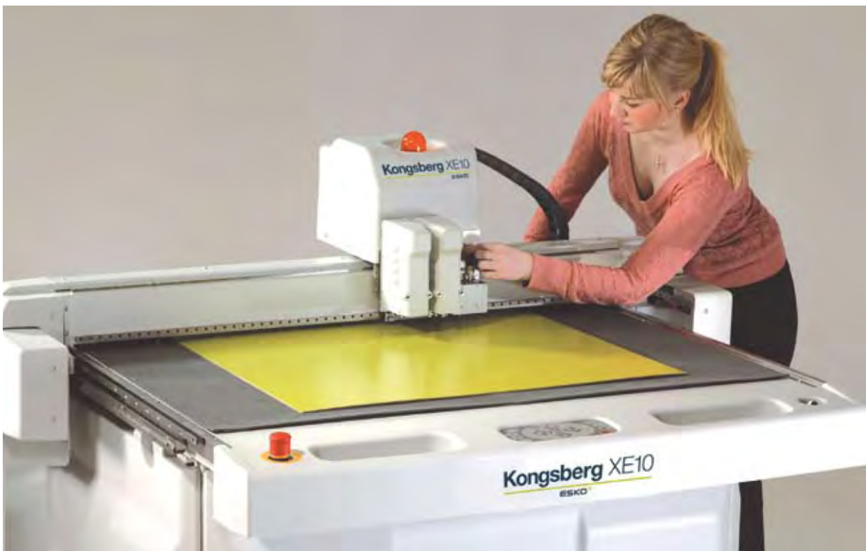
The EskoArtwork Kongsberg XE10 is a small-format dieless digital table for cutting and creasing folding cartons. It is based on the technology and versatile architecture of the Esko Kongsberg XL tables, noted for their power and durability.

The versatile solution from the industry leader of digital cutting and creasing tables for packaging.